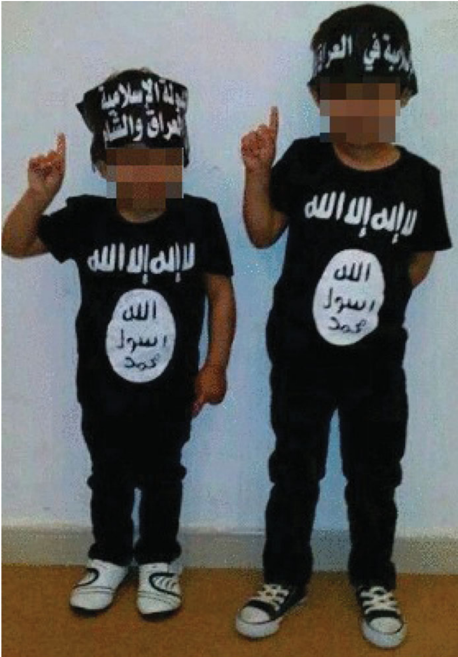
Figure 6. Children dressed in ISIL fan gear featured in Twitter feed posted on jihadist women's network. Source: https://twitter.com/Doula_News/status/460333862438977536/photo/1 .

Twitter is also used to drive traffic to other social media platforms. Supporters back home follow the fighters who post original content and retweet content from organizational accounts. Information flows from organization accounts in Arabic and English via accounts of foreign fighters to a broader network of disseminators (Figure 7). The different layers of microbloggers add localized content. The dissemination of pictures of brutalization ranging