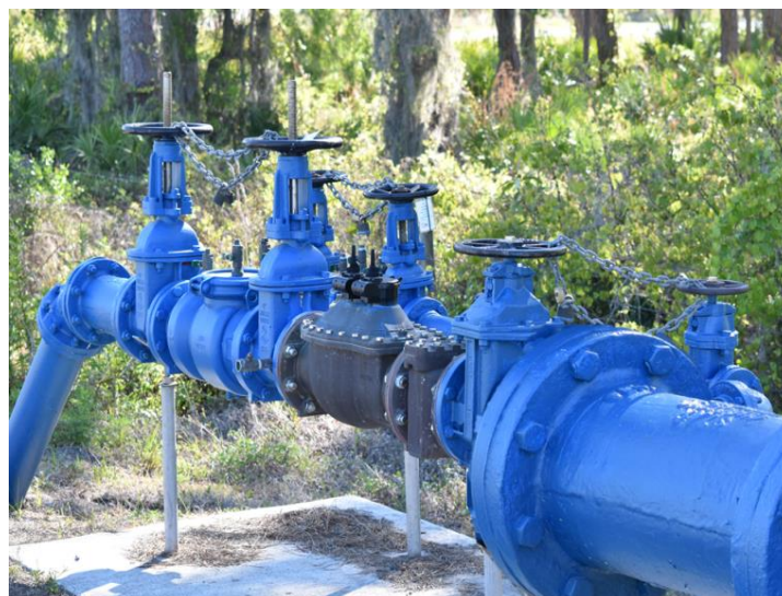
Cross-connection control device.

Brakhage et al. (2016) suggest that loop systems are also referred to as circle systems. Typically, the loop system supplies water from two different directions. However, as seen in the scenario, the water is supplied to the private loop from only one direction making it like a dead-end main. Dead-end mains only allow water to travel in one direction reducing the availability (Brakhage et al., 2016).