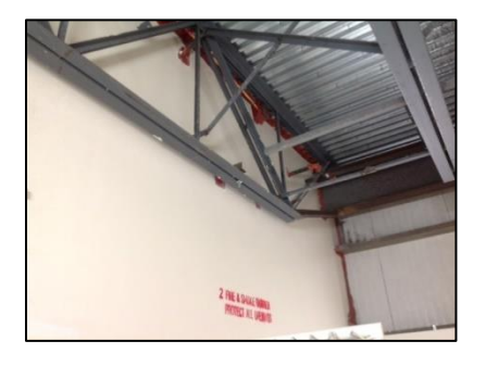
Examples of fire alarm notification system

In addition, fire alarm system activation should not impact other zones being evacuated within the same structure and must be separated by a 2-hour rated wall, and the cabling that carries the notification signal must be rated for 2 hours (Gagnon, 2008).