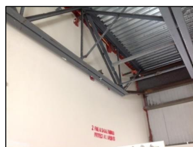
Examples of fire alarm notification system

In addition, fire alarm system activation should not impact other zones being evacuated within the same structure and must be separated by a 2-hour rated wall, and the cabling that carries the notification signal must be rated for 2 hours (Gagnon, 2008).