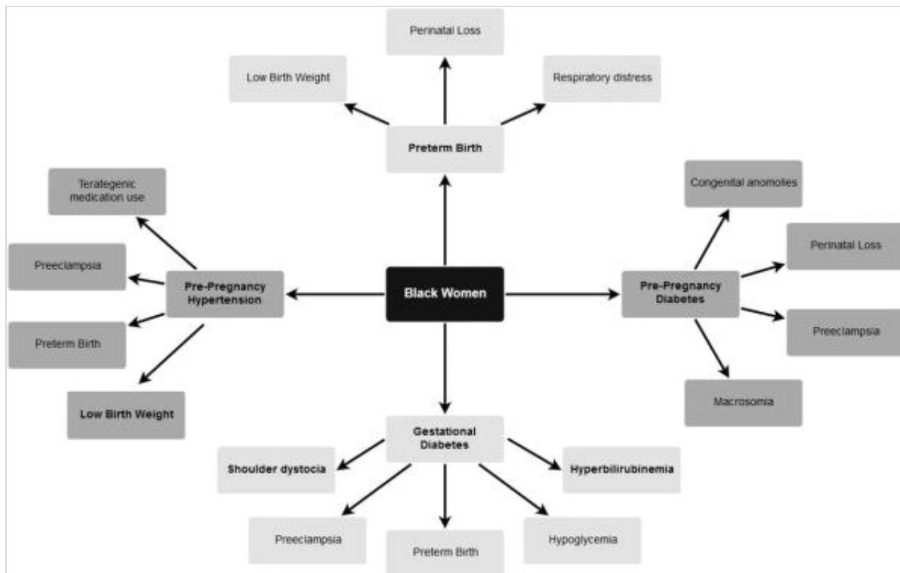
Figure 2. Factors that influence reproductive outcomes for black women.

Blaming black women for poor reproductive health outcomes ignores the circumstances, environments, and situations in which each woman seeks to maintain health, to become pregnant, and to safely give birth to children. Healthcare providers may be abdicating responsibility for providing quality care by implying that negative birth outcomes are unpreventable because black women are coming to pregnancy "older, sicker, and fatter." 12,13 Inequities in maternal health before and during pregnancy are underappreciated but essential context for understanding inequities in the neonatal and perinatal patient populations. Figure 2 illustrates how inequities in 2 prepregnancy illnesses and 2 perinatal conditions disproportionately affecting black women can contribute to inequities in the neonatal and perinatal patient populations. The prevalence, distribution, and implications of pregestational diabetes, chronic hypertension, gestational diabetes, and preterm birth are described in the following text.