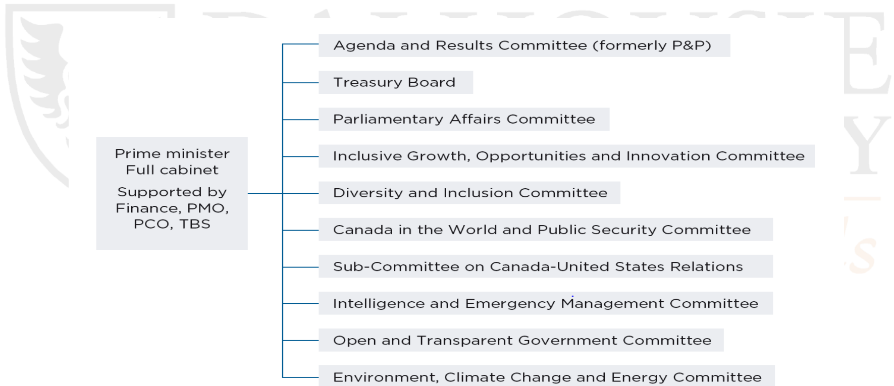
Figure 4.7 Trudeau Cabinet System, 2015