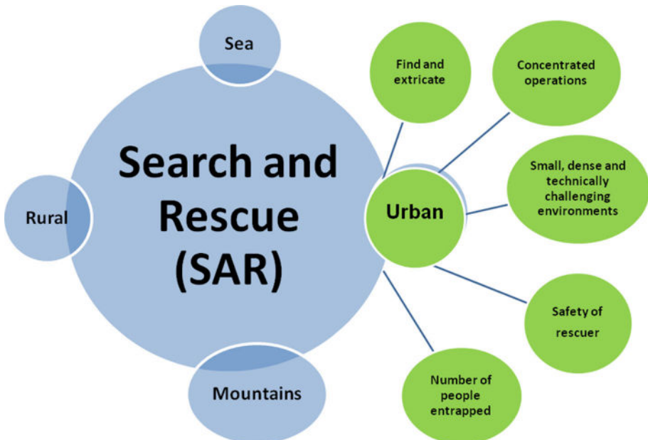
Fig. 1 The different environments of SAR operations and the main characteristics of USAR operations

Nevertheless, despite sustained, often heroic efforts, the relative number of rescued survivors from extended structural collapses remains small (Bartels and VanRooyen 2012). On the other hand, the number of structural collapses due to natural (e.g., Iran, 2003; Indonesia, 2004; Italy, 2009; Haiti, 2010; Japan, 2011), man-made disasters (e.g., Indonesia, 2002) or technological accidents (e.g., Holland, 2000; Russia, 2009; Canada, 2013) is increasing worldwide, raising the death toll of entrapped victims (EM-DAT The OFDA/CRED International Disaster Database 2014; EEA 2010; EERI 2011). To alleviate this,