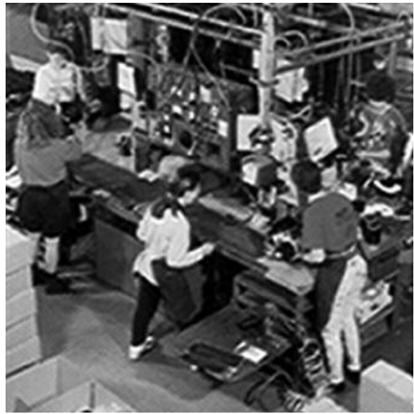
R. W. Beckett Plant