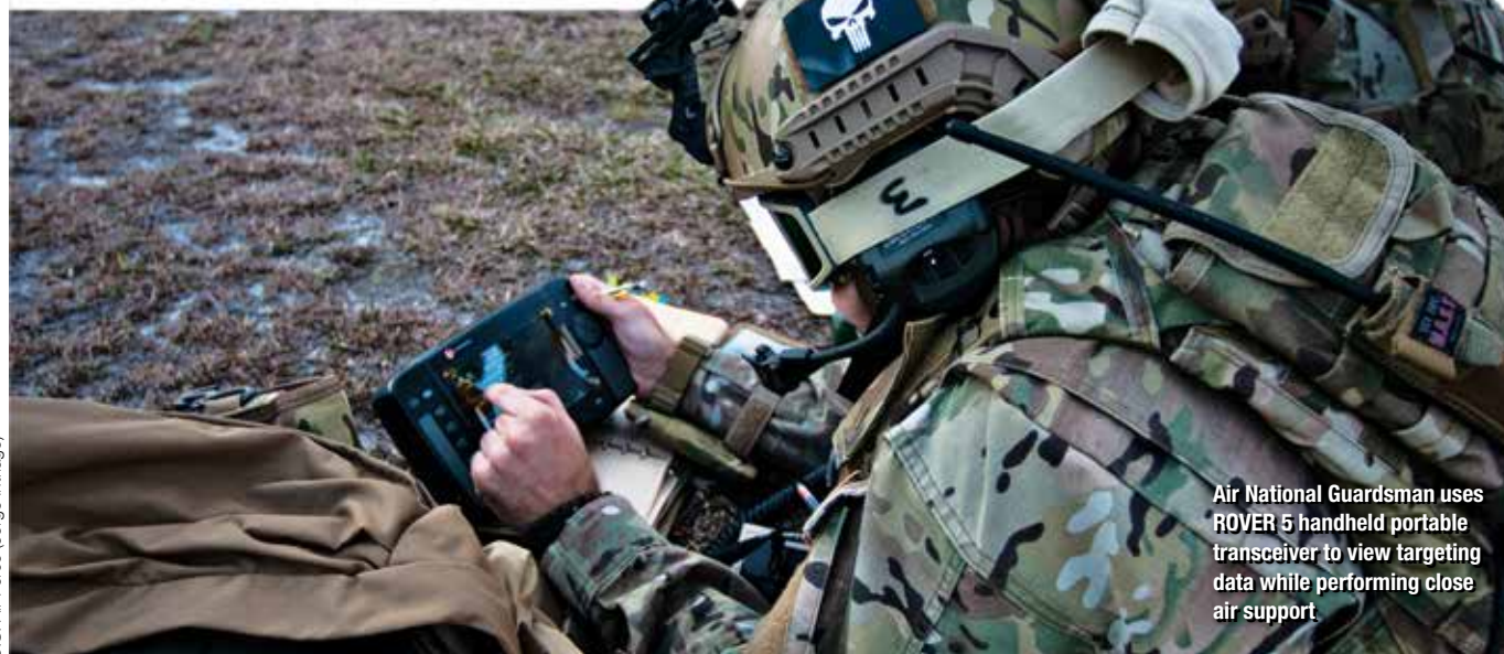
Air National Guardsman uses ROVER 5 handheld portable transceiver to view targeting data while performing close air support.

Department of Defense policy is to comply with the