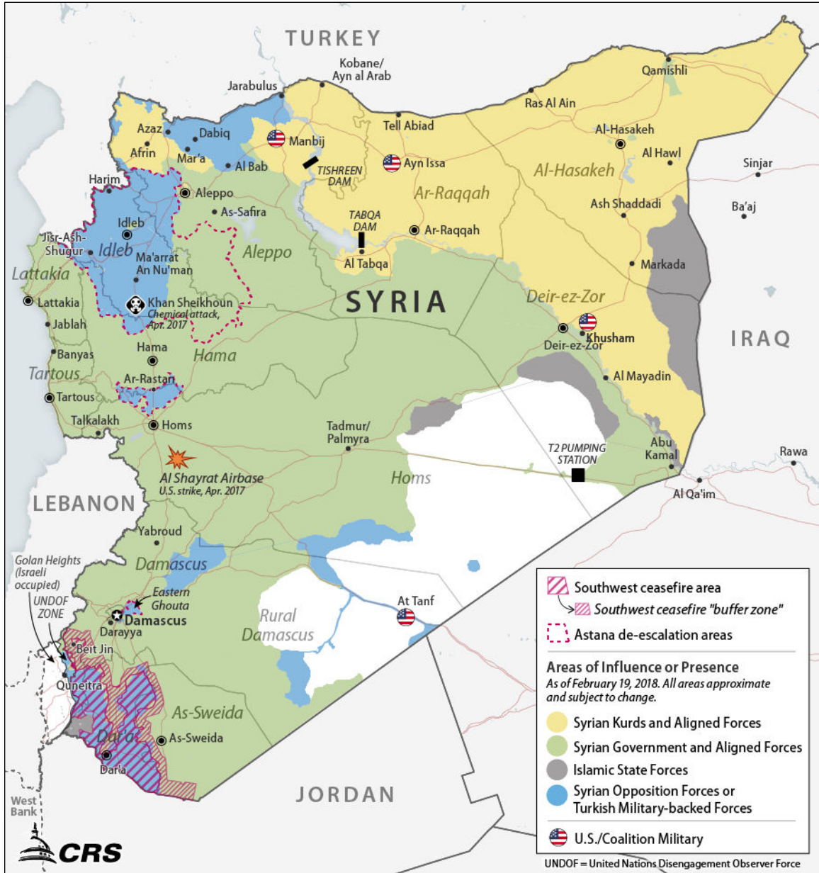
Figure 3. Syria Areas of Influence