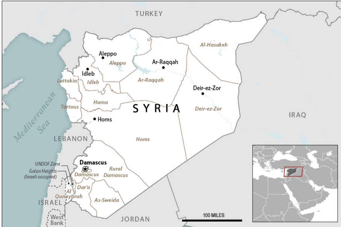
Figure I. Syria: Map and Country Data